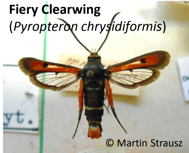
Fiery Clearwing ( Pyropteron chrysidiformis )