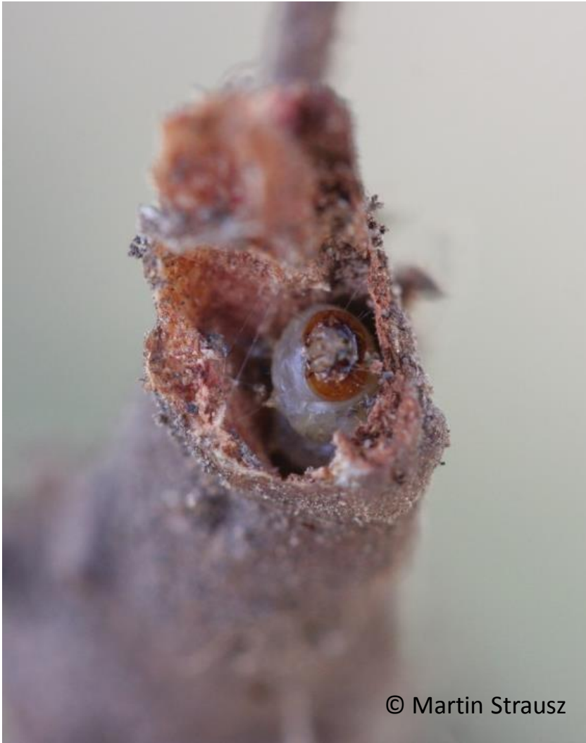
Larva inside a dock-root