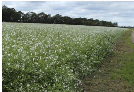
Biomasses and catch crops