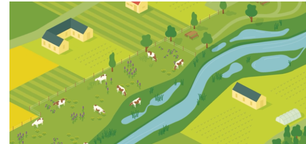
Multifunctional land distribution