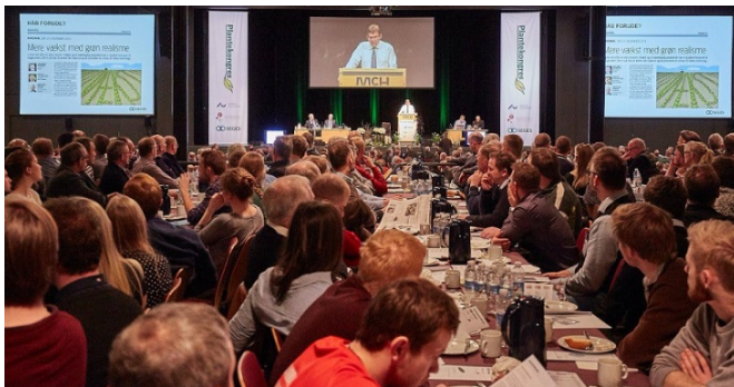
Landbrug & Fødevarer